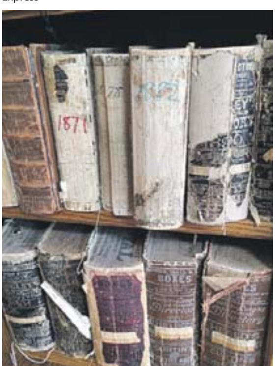
San Francisco street directories